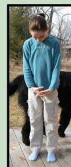
Watch your roots grow and count in your head