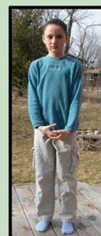
Fold in your branches